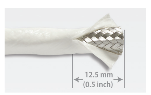
Figure 2: Peel-Back Method

Laser stripping is the ideal method to prep GORE® DVI Cables. Alternatively, Gore recommends using thermal or sharp mechanical strippers. Also, a unique method is to make a short, horizontal slit in the jacket material, peel it back to allow for contact termination and return the jacket to its original position for a neat closure (Figure 2). For more information regarding cable preparation, contact a Gore representative.