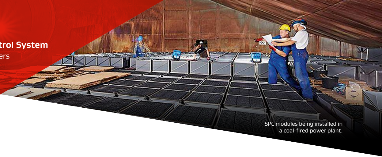
SPC modules being installed in a coal-fired power plant.