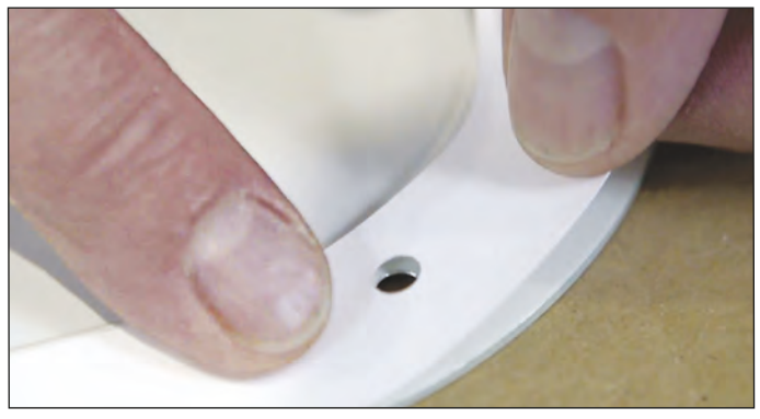
Figure 3: Positioning the gasket

2. Align the gasket so the holes match the fastener holes on the panel. Lay the gasket flat, without stretching it, and peel off the pressure-sensitive adhesive liner carefully (Figure 3).