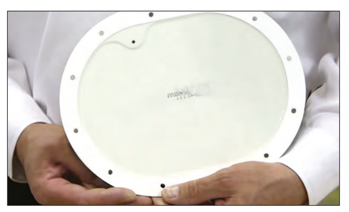
Figure 5: Inspecting the gasket

4. Prior to closing the panel, visually inspect the gasket for damage (Figure 5). Refer to the aircraft maintenance manual for inspection criteria and use/re-use cycles.