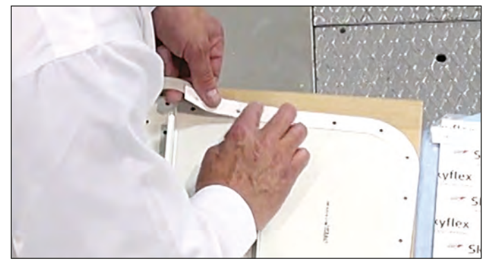
Figure 4: Applying pressure to the gasket

3. Apply light pressure to the gasket once it is aligned (Figure 4).