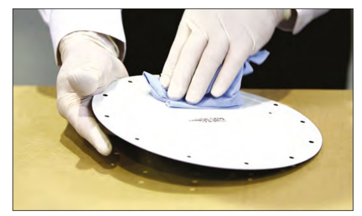
Figure 1: Cleaning the surface