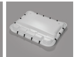
FIGURE 6. Large plate freezer Carrier

* Patent EP3174514; additional patents pending in the US & EU.