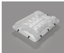
FIGURE 3. Medium blast freezer Carrier