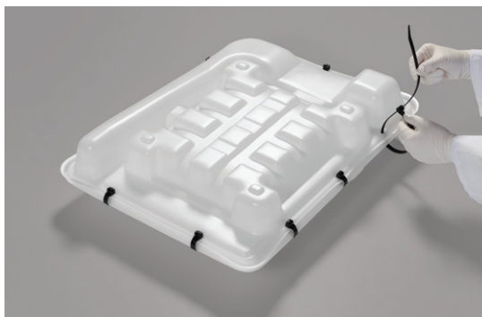
FIGURE 14. Securing the Carrier with cable ties