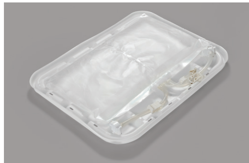
FIGURE 10. Tubing placement, large plate/blast freezer Carrier (shown without Barrier Wrap)