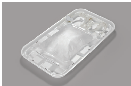
FIGURE 11. Tubing placement, medium plate freezer Carrier (shown without Barrier Wrap)