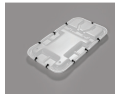
FIGURE 4. Medium plate freezer Carrier