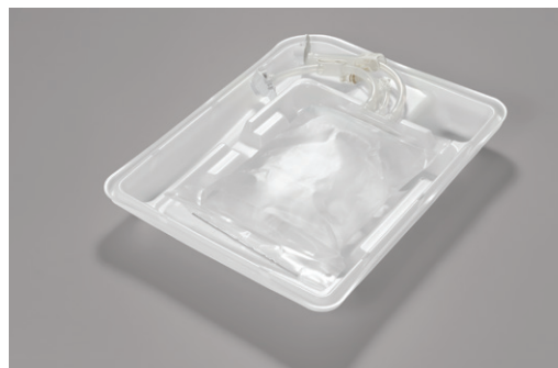
FIGURE 12. Tubing placement, medium blast freezer Carrier (shown without Barrier Wrap)