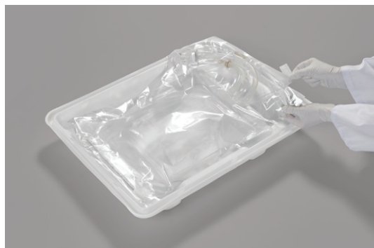
FIGURE 15. Opening the Barrier Wrap using the tear notch