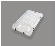
FIGURE 1. Small blast freezer Carrier

† Estimate based on Containers filled to maximum volume.