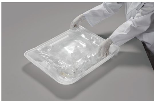
FIGURE 13. Folding the Barrier Wrap into the Carrier