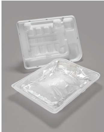
GORE STA-PURE Flexible Freeze Container with Barrier Wrap and Hard-shell Carrier