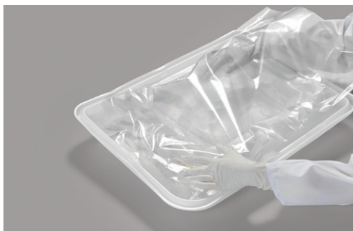
FIGURE 9. Position tubing in Carrier