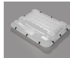
FIGURE 5. Large blast freezer Carrier