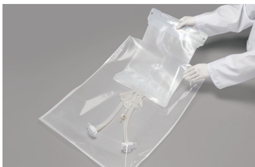
FIGURE 8. Place Container Assembly in Barrier Wrap