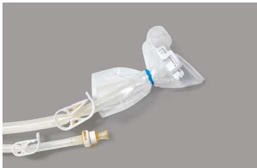
FIGURE 7. Secure the poly bag around the tubing with an appropriate fastener