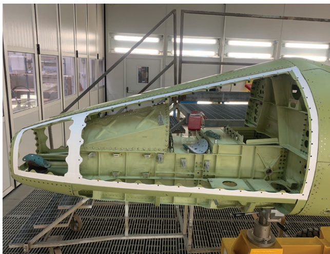
Figure 1: GORE® SKYFLEX® Aerospace Tapes, 700 Series installed on the front fuselage.

In addition, Gore's 700 Series is more durable and robust to reliably protect against corrosion and chafing on the windshield and fuselage panels whenever they are periodically opened and closed. The lower-density construction of Gore's dry tape used to seal the 42 panels weighs only 0.84 kilograms (kg) in comparison to the estimated quantity of polysulfide wet sealant used for the same area that weighs 1.9 kg. Therefore, Leonardo can save approximately 50% in weight using Gore's 700 Series, which translates to more payload on the M-345.