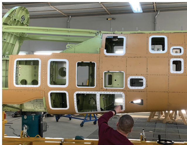
Figure 2: GORE® SKYFLEX® Aerospace Tapes, 700 Series installed on the center fuselage.