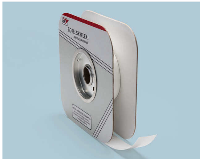
The 700 Series of GORE® SKYFLEX® Aerospace Tapes provides reliable environmental sealing & surface protection performance.