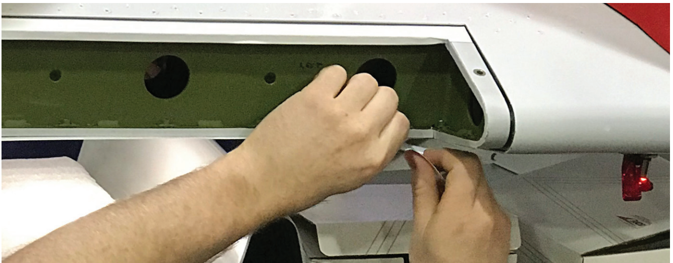
GORE® SKYFLEX® Aerospace Materials are faster and easier to install compared to FIP seals.

Gore's global team of application engineers work closely with you to help evaluate the parameters of your specific application and recommend the appropriate series of GORE® SKYFLEX® Aerospace Materials. We evaluate the material function, operating environment, and faying surfaces to determine compressive forces, gap tolerances, and required material properties. We also evaluate compression curves and our different material properties to determine the appropriate tape or gasket, form thickness, and adhesive for your application to ensure they perform as expected in real-world conditions.