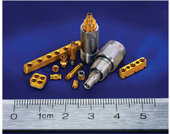
GORE™ 100 Series offers the lowest profile and mass

The blindmate interfaces are robust and durable while being very light weight. A socket-to-socket bullet weighs less than 0.02 grams. All connector constructions use qualified mil standard materials. Instrument grade test adapters are available to 1.85 mm.