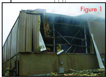
Figure 1: Warehouse Figure 2: Delineation of propane in soil gas. Figure 3: Delineation of organosulfur compounds in soil gas.